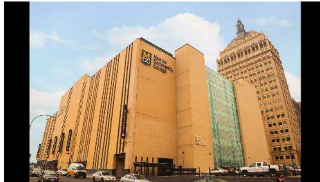
Location Monroe Community College Downtown Campus

Learning & Development Conference October 21-22, 2019